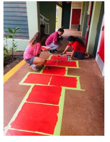
Troops 4030, 4031, 4032, and 4033 repainted their school's hopscotch