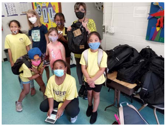
Troops 4141 and 4142 put together school supplies and backpacks for other students in their school