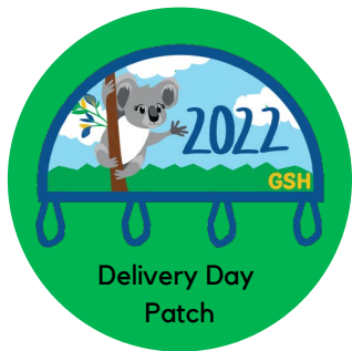
Delivery Day Patch

Collect this exclusive patch and all 4 charms! This year we are debuting instant rewards that will be distributed on Cookie Delivery Day if girls meet the requirements! Girls get rewarded sooner during the 2022 cookie program as she reaches each reward level. She'll get the patch and charms from her troop cookie manager (TCM) right away, no waiting necessary!